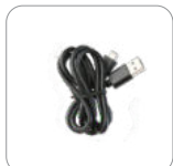
Data Cable (AP515)