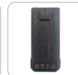
Battery 2000mAh (AP585)