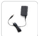
Power Adapter (AP585)