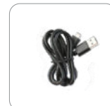
Data cable PC143 (AP585)