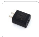
Adapter (USB) (AP515)