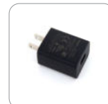
Adapter (USB) (AP585)