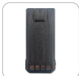
Battery 1500mAh (AP585)