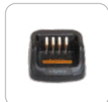
MUC Rapid-rate Charger (AP585)