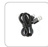
Data cable PC143