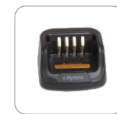
MUC Rapid-rate Charger