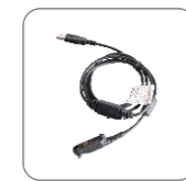
Programming cable PC155